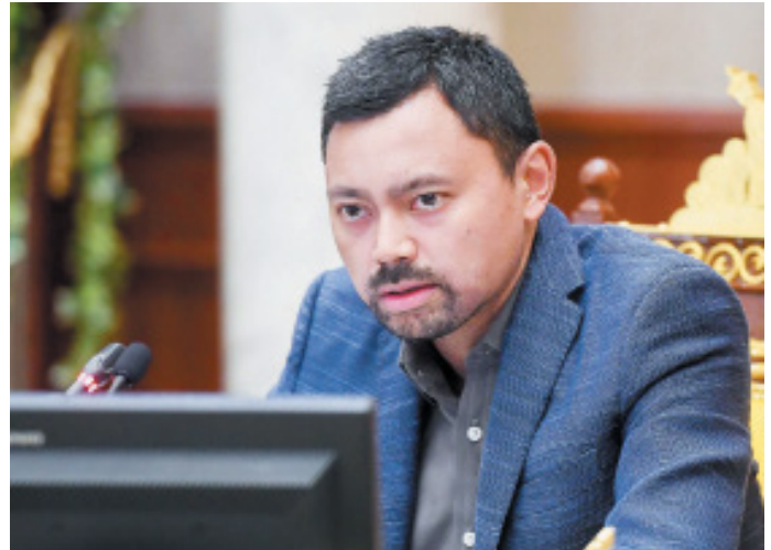
His Royal Highness Prince Haji Al-Muhtadee Billah ibni His Majesty Sultan Haji Hassanal Bolkiah Mu'izzaddin Waddaulah, the Crown Prince and Senior Minister at the Prime Minister's Office delivering a sabda at fifth meeting of the Executive Committee for the Golden Jubilee celebration.

In the sabda , His Royal Highness also reminded all committee members of His Majesty's titah , which highlighted that, the Golden Jubilee Celebration is to honour and appreciate history and stressed that all committees should compile relevant materials for the purpose of archiving history and as reference for future generations.