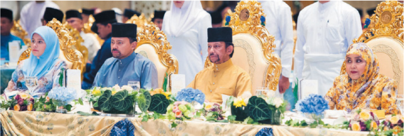
His Majesty Sultan Haji Hassanal Bolkiah Mu'izzaddin Waddaulah ibni Al-Marhum Sultan Haji Omar 'Ali Saifuddien Sa'adul Khairi Waddien, Sultan and Yang Di-Pertuan of Brunei Darussalam and Her Majesty Duli Raja Isteri Pengiran Anak Hajah Saleha binti Al-Marhum Pengiran Pemancha Pengiran Anak Haji Mohamed Alam at the Hari Raya Aidiladha 1438 Hijrah / 2017 Masihi celebration at Istana Nurul Iman. With Their Majesties were His Royal Highness Prince Haji Al-Muhtadee Billah, the Crown Prince and Senior Minister at the Prime Minister's Office and Her Royal Highness Paduka Seri Pengiran Anak Isteri Pengiran Anak Sarah binti Pengiran Haji Salleh Ab. Rahman.