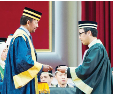
His Majesty awarding a certificate to one of the UBD graduates.

TUNGKU LINK, September 7 – His Majesty Sultan Haji Hassanal Bolkiah Mu'izzaddin Waddaulah ibni Al-Marhum Sultan Haji Omar 'Ali Saifuddien Sa'adul Khairi Waddien, The Sultan and Yang Di-Pertuan of Brunei Darussalam, Chancellor of Universiti Brunei Darussalam (UBD) consented to award certificates to 863 graduates at UBD's 29th convocation ceremony held at Chancellor's Hall.