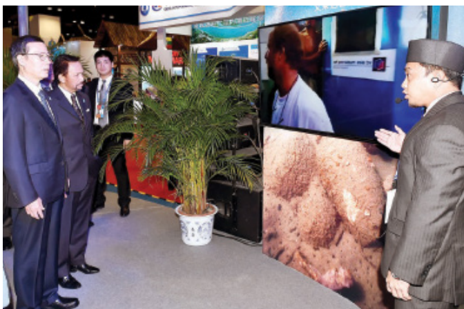
His Majesty together with His Excellency Zhang Gaoli toured the Brunei Darussalam City of Charm Pavilion.

Shortly thereafter, His Majesty welcomed His Excellency Zhang Gaoli to the pavilion and together, inaugurated the opening of the Brunei Darussalam