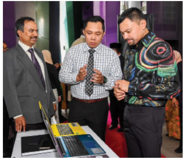
His Royal Highness Prince (Dr) Haji Al-Muhtadee Billah, the Crown Prince and Senior Minister at the Prime Minister's Office, and Pro-Chancellor of UTB touring the Innov8 exhibition.

To innovate is also one of the core values of UTB. The other core values are professionalism, integrity, being passionate and engaging.