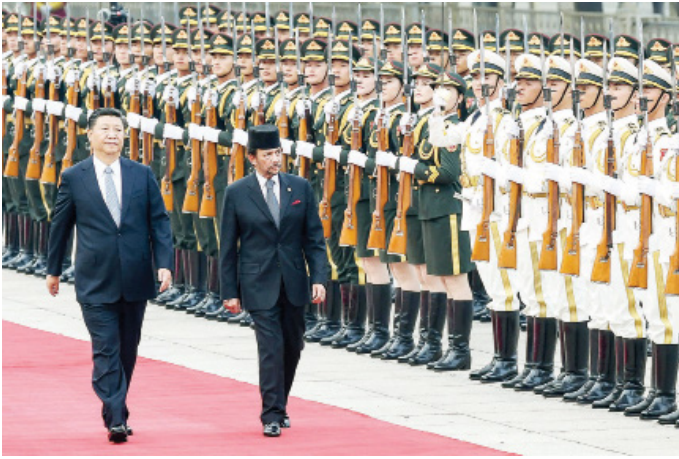
His Majesty inspecting the Guard of Honour mounted by the People's Liberation Army.