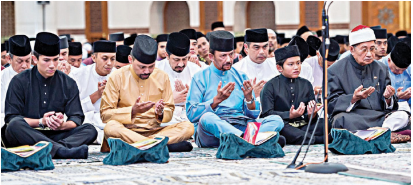
His Majesty Sultan Haji Hassanal Bolkiah Mu'izzaddin Waddaulah ibni Al-Marhum Sultan Haji Omar 'Ali Saifuddien Sa'adul Khairi Waddien, Sultan and Yang Di-Pertuan of Brunei Darussalam; His Royal Highness Prince Haji Al-Muhtadee Billah, the Crown Prince and Senior Minister at the Prime Minister's Office; His Royal Highness Prince 'Abdul Mateen and His Royal Highness Prince 'Abdul Wakeel joining other congregants together in the recitation of the Doa Akhir Tahun 1438 Hijrah and Doa Awal Tahun 1439 Hijrah .