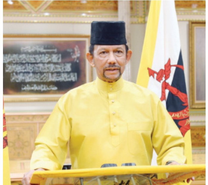
His Majesty Sultan Haji Hassanal Bolkiah Mu'izzaddin Waddaulah ibni Al-Marhum Sultan Haji Omar 'Ali Saifuddien Sa'adul Khairi Waddien, Sultan and Yang Di-Pertuan of Brunei Darussalam delivering a titah in conjunction Hari Raya Aidil Adha 1438 Hijrah 2017 Masihi at the Istana Nurul Iman.

His Majesty also said that if a person is consistently obedient, then he is full of patience, because there cannot be obedience without patience. Another example would be a person who is fasting, without patience, fasting may not be possible for that person.