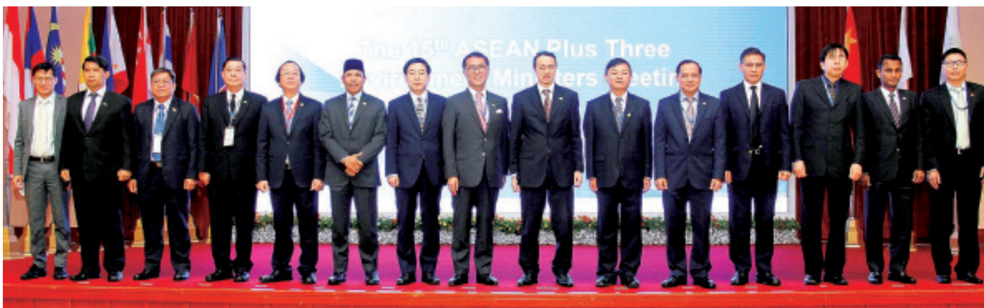
The Minister of Development, Yang Berhormat Dato Seri Setia Awang Haji Bahrin bin Abdullah at the 15th EMM + 3 Ministerial Meeting on the Environment held at the International Conference Centre.

BERAKAS, September 13 - Through the ASEAN +3 Environmental Ministerial Meeting it is hoped that it will result in a more beneficial and productive collaboration, especially in promoting environmental cooperation between ASEAN and +3 partners as well as welcoming other potential collaborations in the field of environment in the future.