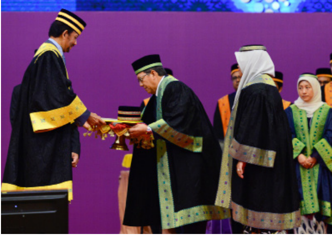
His Majesty Sultan Haji Hassanal Bolkiah Mu'izzaddin Waddaulah ibni Al-Marhum Sultan Haji Omar 'Ali Saifuddien Sa'adul Khairi Waddien, Sultan and Yang Di-Pertuan of Brunei Darussalam, the Chancellor of Universiti Teknologi Brunei receiving the conferment of the Honourary Doctorate in Engineering from the university, presented by the Minister of Education and Chairman of the UTB Council, Pehin Orang Kaya Indera Pahlawan Dato Seri Setia Awang Haji Suyoi bin Haji Osman.

TUNGKU LINK, September 30 – His Majesty Sultan Haji Hassanal Bolkiah Mu'izzaddin Waddaulah ibni Al-Marhum Sultan Haji Omar 'Ali Saifuddien Sa'adul Khairi Waddien, The Sultan and Yang Di-Pertuan of Brunei Darussalam, Chancellor of University Technology Brunei (UTB) consented to receive the conferment of the Honourary Doctorate in Engineering.