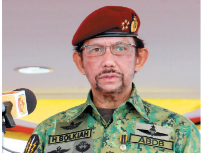
His Majesty Sultan Haji Hassanal Bolkiah Mu'izzaddin Waddaulah ibni Al-Marhum Sultan Haji Omar 'Ali Saifuddien Sa'adul Khairi Waddien, Sultan and Yang Di-Pertuan of Brunei Darussalam delivering a titah at the RBAF's 56th Anniversary celebration.

In a titah (royal speech) delivered at the parade ground, His Majesty called on the Royal Brunei Armed Forces to continue