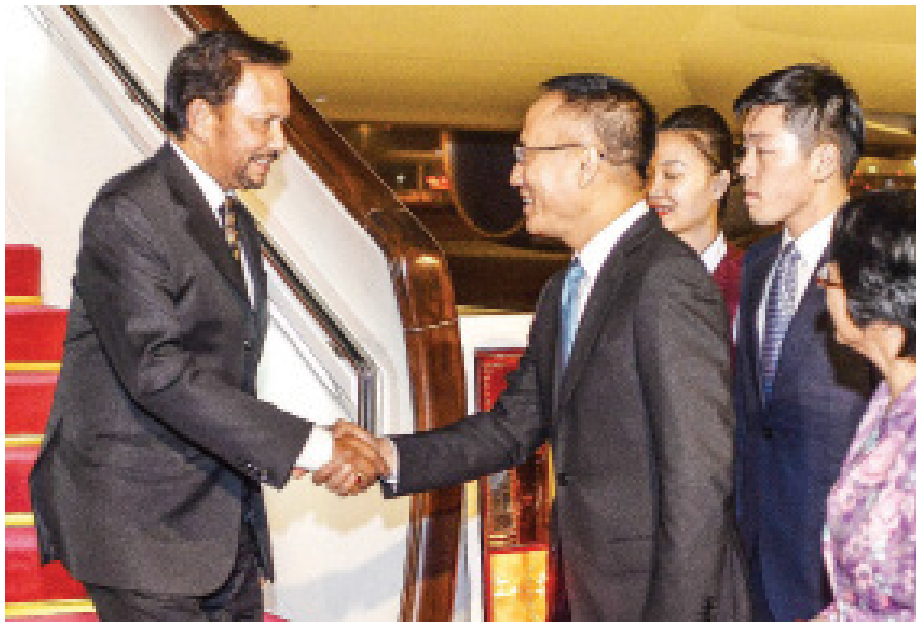
His Majesty Sultan Haji Hassanal Bolkiah Mu'izzaddin Waddaulah ibni Al-Marhum Sultan Haji Omar 'Ali Saifuddien Sa'adul Khairi Waddien, Sultan and Yang Di-Pertuan of Brunei Darussalam being greeted by His Excellency Chen Xiaodong, the Assistant Minister of Foreign Affairs of the People's Republic of China.

Later in the evening, His Majesty and His Royal Highness arrived at the Beijing Capital International Airport. His Majesty's arrival was greeted by His Excellency Chen Xiaodong, the Assistant Minister of Foreign Affairs of the People's Republic of China. His Majesty consented to receive a flower bouquet before walking past a Static Guard mounted by the People's Liberation Army and boarded a motorcade to His Majesty's hotel.