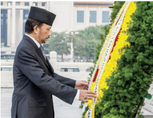
His Majesty laying a wreath at the Monument to the People's Heroes.

In the afternoon , His Majesty attended a Wreath-laying Ceremony held at the Monument to the People's Heroes.