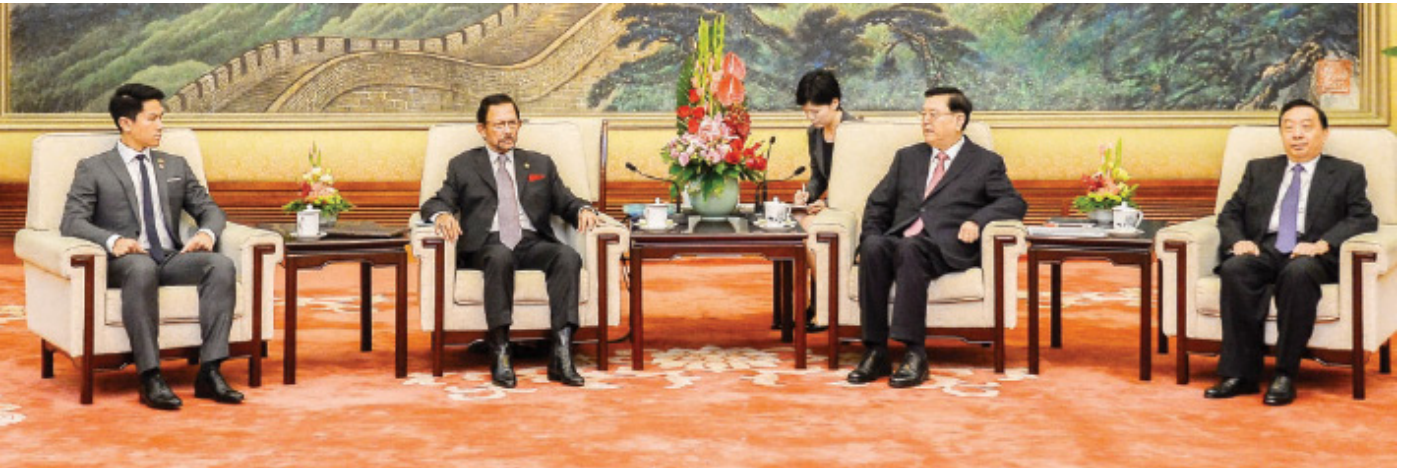
His Majesty consented during the Bilateral Meeting with His Excellency Zhang Dejiang, the Chairman of the Standing Committee of the National People's Congress (NPC) of the People's Republic of China held at the Reception Hall, the Great Hall of the People, Beijing. Accompanying His Majesty was His Royal Highness Prince 'Abdul Mateen.

His Majesty with His Excellency Zhang Dejiang, the Chairman of the Standing Committee of the National People's Congress (NPC) of the People's Republic of China.