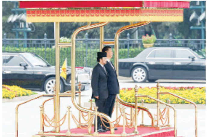
His Majesty receiving the Official Salute, accompanied with the playing of the national anthems of Brunei Darussalam and the People's Republic of China and a 21 gun salute.