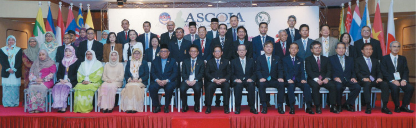
Yang Berhormat Pehin Orang Kaya Indera Pahlawan Dato Seri Setia Awang Haji Suyoi bin Haji Osman, Minister of Education in a group photo with alumni ASCOJA from ASEAN countries.

BANDAR SERI BEGAWAN, September 9 - With the theme of Enriching ASEAN - Japan Relations Through Culture, Education and Economy, the 23rd ASEAN Council of Japan Alumni (ASCOJA) Conference aims to address the needs of multi-disciplinary approaches to achieve a truly integrated ASEAN with one heart, one mind and with Japan as a partner.