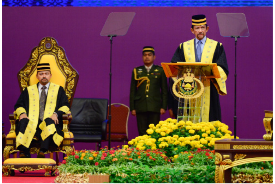
His Majesty Sultan Haji Hassanal Bolkiah Mu'izzaddin Waddaulah ibni Al-Marhum Sultan Haji Omar 'Ali Saifuddin Sa'adul Khairi Waddien, Sultan and Yang Di-Pertuan of Brunei Darussalam, the Chancellor of Universiti Teknologi Brunei delivering a titah during UTB's 5th Convocation.

In addition, His Majesty also understood that cooperation between UTB and Sesame World Technology Company has resulted in significant innovation through the production of Directed Sound System which has commercial value.