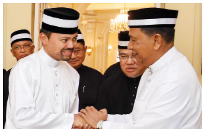
His Royal Highness Prince Haji Al-Muhtadee Billah ibni His Majesty Sultan Haji Hassanal Bolkhiah Mu'izzaddin Waddaulah, the Deputy Sultan with His Royal Highness Sultan Al-Mu'tassimu Billahi Muhibbuddin Sultan Abdul Halim Mu'adzam Shah Al-Haj, a member of Kedah Darul Aman's royal family.