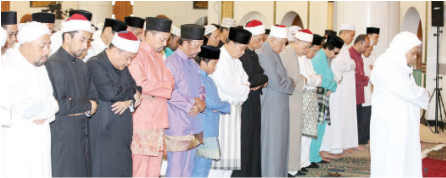
His Majesty Sultan Haji Hassanal Bolkiah Mu'izzaddin Waddaulah ibni Al-Marhum Sultan Haji Omar 'Ali Saifuddin Sa'adul Khairi Waddien, The Sultan and Yang Di-Pertuan of Brunei Darussalam performing the Friday Prayer at Jame' 'Asr Hassanil Bolkiah, Kampung Kiarong. Also present, His Royal Highness Crown Prince Haji Al-Muhtadee Billah and His Royal Highness Prince 'Abdul Wakeel.

BANDAR SERI BEGAWAN, September 22 - We as Muslims are bound to two forms of brotherhood; brotherhood as one family and brotherhood in religion (Islam).