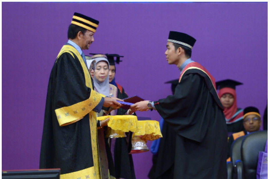
His Majesty presenting the certificate to a UTB graduate.