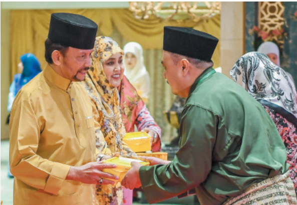
Their Majesties gifting the Korban meat to 100 chosen recipients.