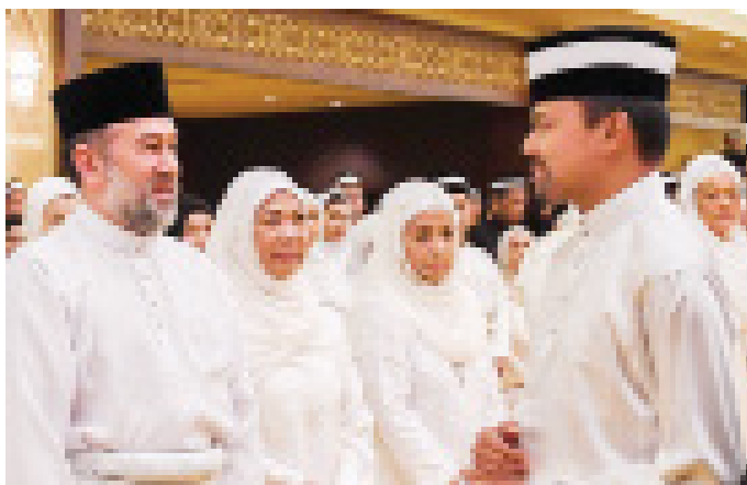
His Royal Highness Prince Haji Al-Muhtadee Billah ibni His Majesty Sultan Haji Hassanal Bolkhiah Mu'izzaddin Waddaulah, the Deputy Sultan with His Majesty Sultan Muhammad V, Yang Di-Pertuan Agong.