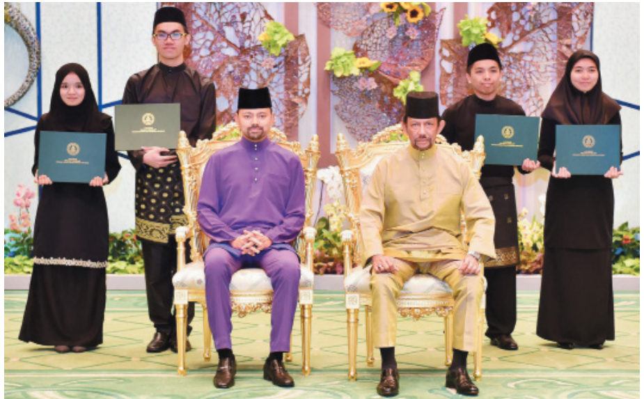
His Majesty Sultan Haji Hassanal Bolkiah Mu'izzaddin Waddaulah, The Sultan and Yang Di-Pertuan of Brunei Darussalam and His Royal Highness Prince Haji Al-Muhtadee Billah, The Crown Prince and Senior Minister at the Prime Minister's Office in a group photo with the recipients of the Sultan's Scholar.