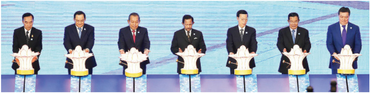
His Majesty the Sultan and Yang Di-Pertuan of Brunei Darussalam launches the 14 th CAEXPO and CABIS with Member of the Standing Committee of the Political Bureau of the Communist Party of China (CPC) Central Committee and His Excellency Zhang Gaoli, Vice Premier of the State Council, People's Republic of China and other leaders.

His Majesty commended Brunei Darussalam's special economic relationship with the Guangxi Zhuang Autonomous Region and welcomed the collaboration between both sides under the Brunei-Guangxi Economic Corridor (BGEC) that includes cooperation in areas such as ports, fisheries and clean energy technology.