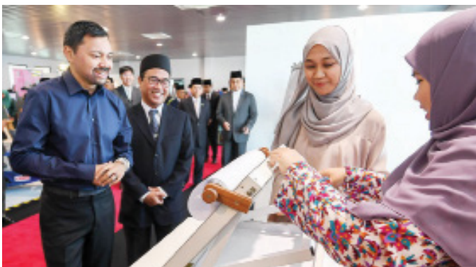
HRH touring the exhibits created by UBD students at the UBD Convocation Festival in conjunction with the 29th UBD Convocation Ceremony this year.

TUNGKU LINK, September 4 - His Royal Highness Prince (Dr) Haji Al-Muhtadee Billah ibni His Majesty Sultan Haji Hassanal Bolkiah Mu'izzaddin Waddaulah, The Crown Prince and Senior Minister at the Prime Minister's Office, Pro-Chancellor of University of Brunei Darussalam (UBD) consented to officiate the UBD Convocation Fair in conjunction with the 29th UBD Convocation Ceremony this year.