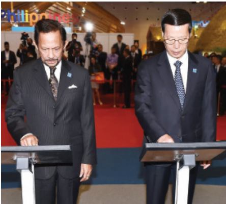
His Majesty together with His Excellency Zhang Gaoli inaugurates the opening of the Brunei Darussalam City of Charm Pavilion.